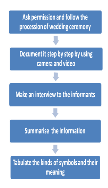
Table 3.1 Data Collection Diagram