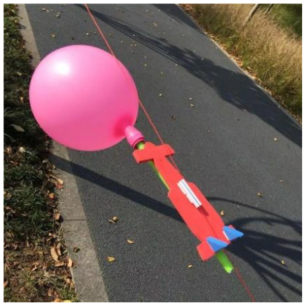
Figure 5. Simple Rocket Instructional Aid

It was made of foam, fishing line, straw, and baloon. This simple baloon rocket works if installed balloons and straws will take off on the fishing line until the air in the balloon is completely depleted when the balloon is released, the air will be compressed and go into space so that the balloon will advance like a rocket. The working principle of the rocket is in accordance with Newton III Law theory "For each force of action, will produce the same reaction force but the opposite direction". It is commonly referred to as "Action = reaction" style. Simple rocket instructional aid can be seen in Figure 5.