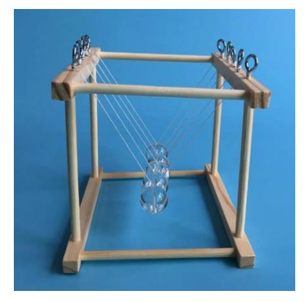
Figure 4. Simple Pendulum