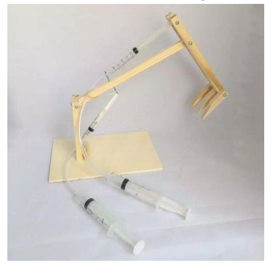
Figure 2. Simple Hydraulic Arm Instructional Aid

It was made of a popsicle stick, magnetic bar, and piece of wood. Seesaw employs the principle of equilibrium and first class levers with the fulcrum position that lies between the load and the power. Equilibrium at the seesaw is a condition where the load is balanced by power and the fulcrum is the main key in forming equilibrium. If the burden is heavier than the power, the seesaw will tilt towards the load. Static equilibrium in this visual aid occurs if the force acting on the object is equal to (0) and the amount of torque against any point on the object is equal to zero. Stiff body balance requirements If the forces acting on the xy plane. Simple seesaw instructional aid can be seen in Figure 3.