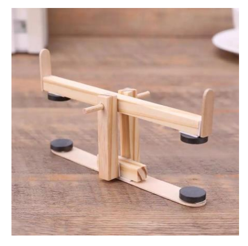
Figure 3. Seesaw Instructional Aid