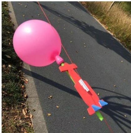
Figure 5. Simple Rocket Instructional Aid

It was made of foam, fishing line, straw, and balloon. This simple balloon rocket works if installed balloons and straws will take off on the fishing line until the air in the balloon is completely depleted when the balloon is released, the air will be compressed and go into space so that the balloon will advance like a rocket. The working principle of the rocket is in accordance with Newton III Law theory "For each force of action, will produce the same reaction force but the opposite direction". It is commonly referred to as "Action = reaction" style. Simple rocket instructional aid can be seen in Figure 5.