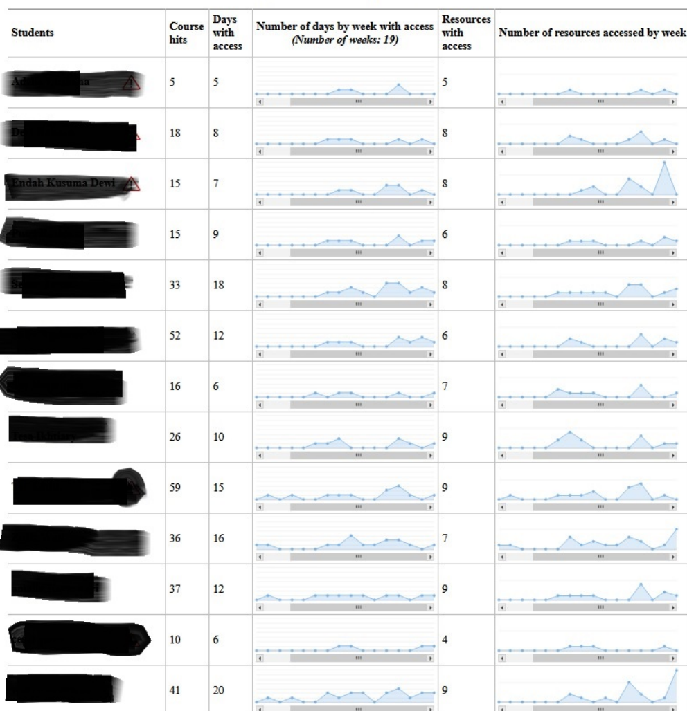
Figure 1. The Statistics Results of Students Attendance on the E-learning Session