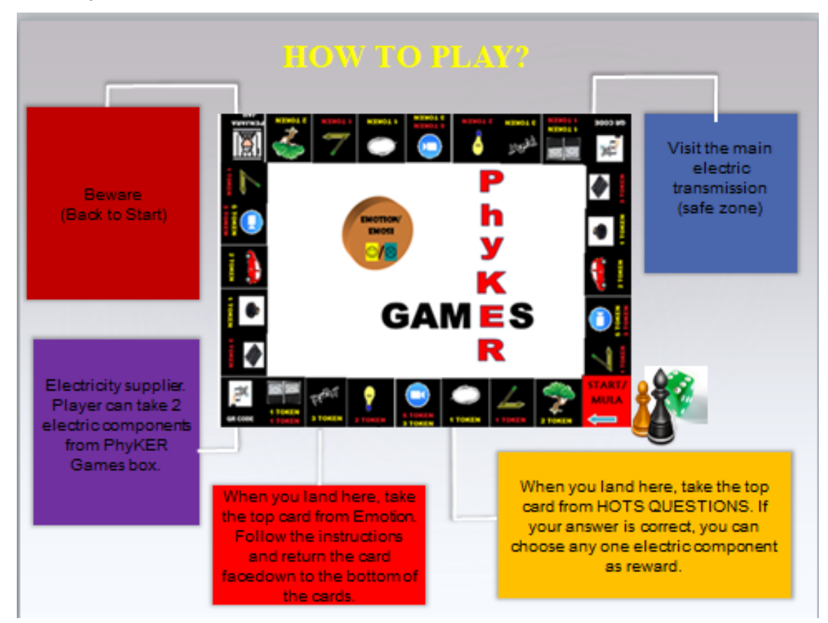
Figure 2. Regulation and challenges in PhyKER Games

Each player must throw the dice. The player with the highest number of dice starts to play. Both players place the player representative in the "START" box, then drop the dice and move the