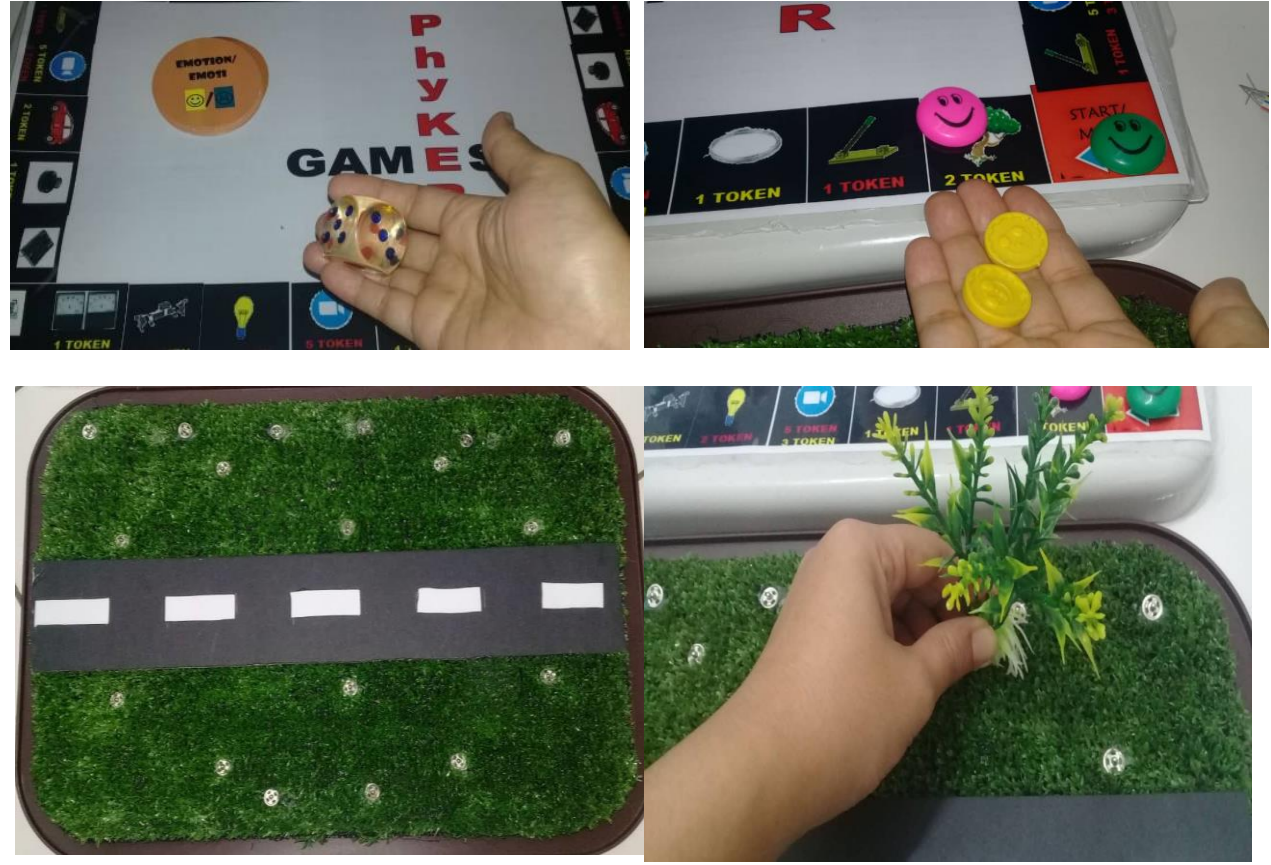
Figure 4. The step that players need to complete the game

Figure 4 show the step that players need to complete the game which is start from thrown the dice. Then buy the diorama accessories and electronic component using red or yellow tokens. They must to complete both circuits (series and parallel) with plug and play at diorama board. According to Sudjana and Rivai (2011), dioramas can be categorized as real objects similar to the real world but resized on a smaller scale.