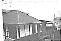
Figure 6. Traditional Houses in the Dieng Highlands

The community camp in Wonosobo has social issues related to the traditional houses of the Dieng Plateau. Most houses have low roofs (less than 2.5 meters) as well as zinc roofing material. This is very different when compared to houses in general with a height of more than 2.5 meters and a tile roof.