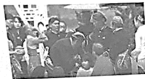
Figure 5. Dreadlocks

The social issue of boys who have dreadlocks is believed by the people of Wonosobo to have a sacred nature in their lives. Usually the growth of dreadlocks (dreadlocks) after a high fever. Based on this social issue, answer the following question.