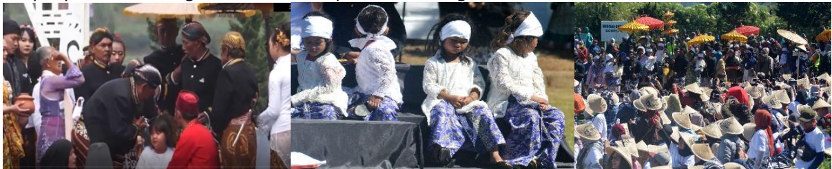
Figure 1. Dreadlocks treatment in DCF

performances (Harmawati, Y., Aim Abdulkarim, 2016). DCF aims to provide indigenous knowledge of the people of the Dieng Plateau which is presented in Figure 1.