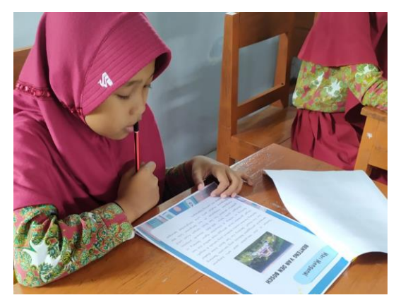
Figure 2. Students Begin to Read the Problems

The next activity is explaining contextual problems according to the RME approach. In explaining contextual problems, the teacher asks students to convey what they can absorb from the reading and existing problems.