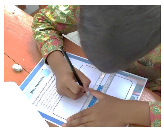
Figure 3. Students Solving Problems

The next activity in the RME approach is solving contextual problems. In solving this problem, students will be assisted by the stages of iceberg theory that have been compiled into student worksheets. Students draw a window to then be given information that refers to solving the problem. This activity is part of iceberg theory in the form of a model of.