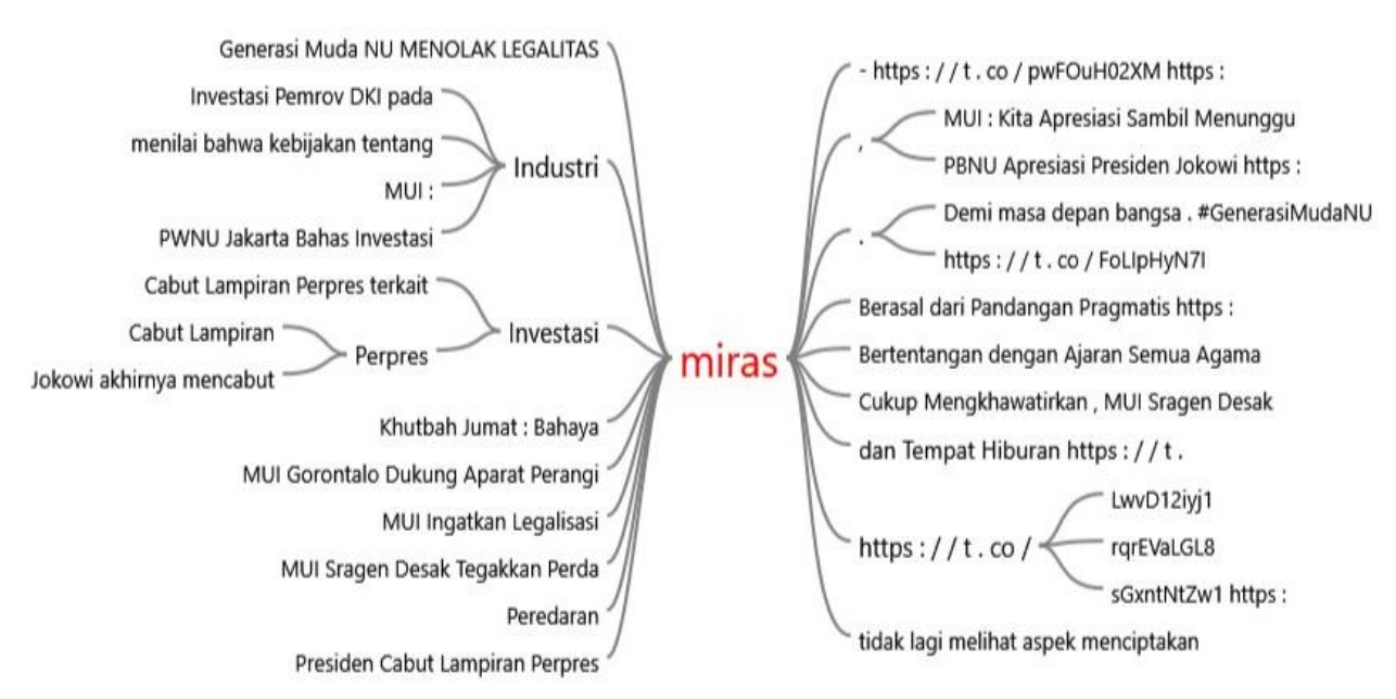
Figure 1. Public narrative relations

Content analysis shows that the use of narratives related to alcohol investment policy problems is influenced by several problems that arise, including religious and social factors of the community. In addition, the results of the visualization of narrative relations show the participation of community organizations and the public in general in producing policy narratives. In this case, the role of community organizations can provide legitimacy to the public, which can create a greater power of social movement capital. As for the policy narrative, the rejection of alcohol investment is also carried out by the official social media accounts of community organizations, including Muhammadiyah, Nahdatul Ulama, and the Indonesian Ulema Council. The narrative results of the social movement rejecting alcohol investment in Indonesia show a high collectivity related to the rejection of government policies. The policy actor makes the rejection based on the objective aspect of influencing policy refusal. Based on the results of the narrative visualization, it shows the primary reasons for rejecting the policy, based on the very pragmatic alcohol investment policy and contrary to religion.