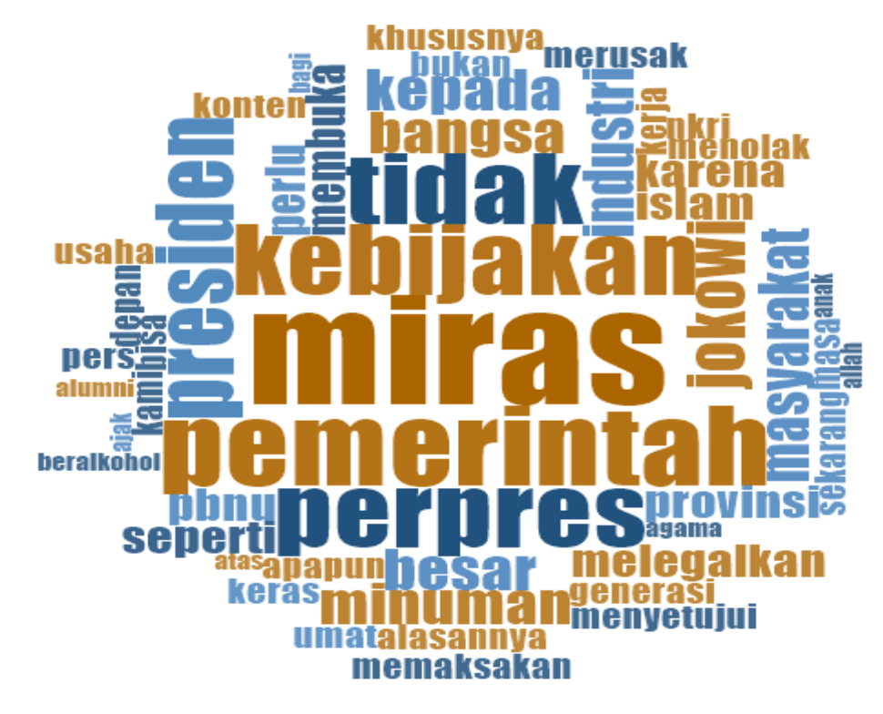
Figure 4. The public's negative narrative of alcohol investment

Analysis of the relationship between each policy actor in Indonesia's alcohol investment policy process, substantially the majority of what is conveyed can be seen through the dominant content. The message conveyed by the analysis related to the aims and objectives conveyed through social media and media is as follows.