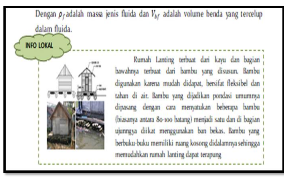
Figure 2. Local wisdom in the module