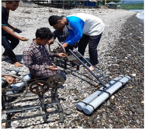
Figure 1. Testing of ocean wave energy converter prototype on the beach

Performance appraisal data were analyzed descriptively, the maximum score given for each task item was 4 with information, 4 is very satisfying, 3 is satisfying, 2 is partly satisfying, and 1 is not satisfying. While the data of essay test result were analyzed using a normalized gain score (N-gain) to determine the increase in concept mastery and creative thinking skills of pre-service physics teachers regarding the topic of using ocean wave energy as a renewable energy source. The N-gain score can be calculated using the Formula 1 (Hake, 1998).