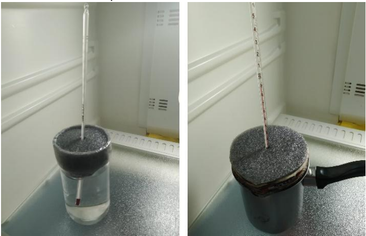
Figure 2. Prepared containers used within the experimental setups.

The experimental setup for the two different measurements are shown in Figure 2. It is important to express, at this stage, that the top of the containers should be well insulated with an appropriate insulating material so that the heat flow from the upper part of the container can be negligible because we only aim to measure the thermal conductivity of the containers, specifically glass or steel. The experimental procedure can be summarized as follows: (1) Boil the water and fill the container to an appropriate level; (2) seal the top of the container; (3) place the thermometer properly; (4) place the container in the fridge; (5) read the temperature of the water at appropriate times and record the exact times and temperatures.