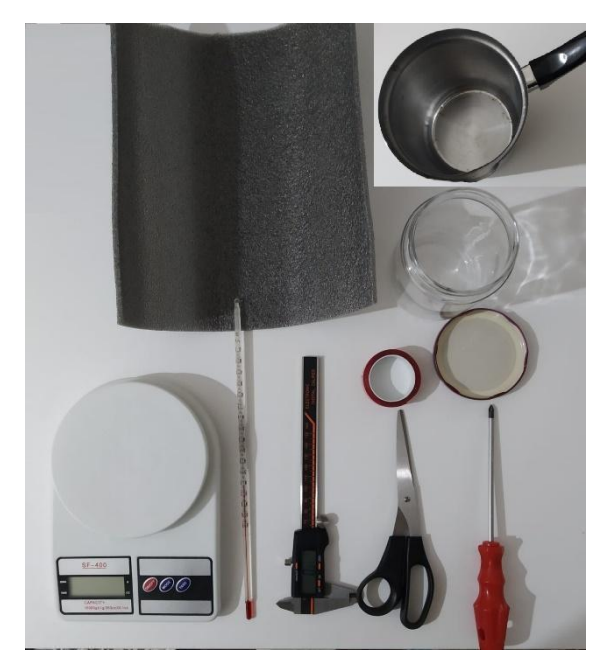
Figure 1. Photography of the components employed in the experiment.

The experimental setup for the two different measurements are shown in Figure 2. It is important to express, at this stage, that the top of the containers should be well insulated with an appropriate insulating material so that the heat flow from the upper part of the container can be negligible because we only aim to measure the thermal conductivity of the containers, specifically glass or steel. The experimental procedure can be summarized as follows: (1) Boil the water and fill the container to an appropriate level; (2) seal the top of the container; (3) place the thermometer properly; (4) place the container in the fridge; (5) read the temperature of the water at appropriate times and record the exact times and temperatures.