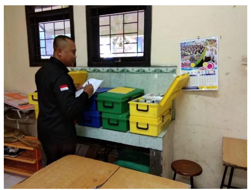
Figure 3. Laboratory observation